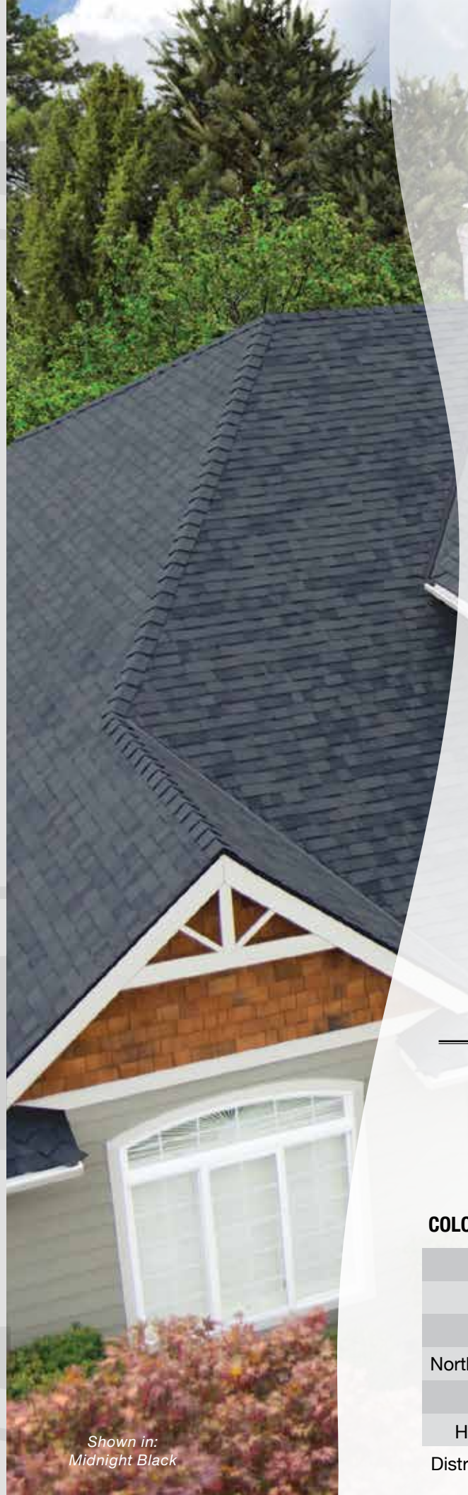
Shown in: Midnight Black

TESTING, APPROVALS, & WARRANTY •ASTM D7158 Class H •ASTM D3462 •ASTM D3161 Class F •ASTM D3018 Type I •ASTM E108 Class A Fire Rating •CSA A123.5 •ICC Approval – ESR 3150 •FBC Approval – #14809 •12-year Right Start™ Warranty •LIMITED LIFETIME WARRANTY available. For more information, visit: WWW.MALARKEYROOFING.COM