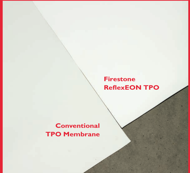
ReflexEON TPO is significantly whiter and brighter than standard TPO membrane.

The chief advantage of a light colored roof is its ability to reflect UV radiation which may improve a building's energy efficiency. Firestone's new ReflexEON TPO extends those advantages, as it is the brightest, most reflective TPO membrane on the market today. Additionally, the increased brightness will help to maintain its reflectivity level.